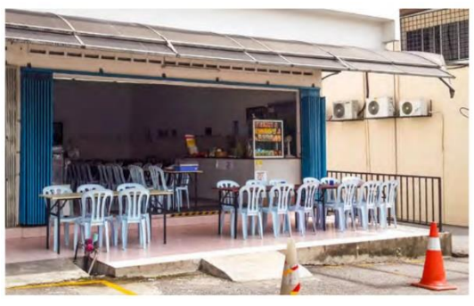
Figure 6: Vendors of Nasi Lemak Ali (Review 12), customers at Nasi Lemak Tanglin (Review 9) and the outlet for Nasi Lemak Kak Maimon (Review 15) (clockwise from top left) The representation of visual elements we observe in the Supplementary Visuals aligns with my earlier observation of textual chunks or rhetorical units that describe the three aspects accompanying the evaluative description of the Nasi Lemak itself. A glance at the layout arrangement of the text and visual in this review shows that the Supplementary Visual occurs alongside the descriptions of the side dishes, people, and place – often after the text descriptions. This text-visual structure hints at how these Supplementary Visuals work in tandem with the paragraphs of text containing the description of the three aspects to create the narrative of a Nasi Lemak review.

Akin to the relationship between the title and the Main Visual, the textual paragraphs and the Supplementary Visuals complement each other and contextualise the Nasi Lemak dish for the readers. Both components allow readers to immerse themselves in the closest possible manner to the real-world experience of 'encountering' the nasi lemak, enabling the readers to relate and even subtly convincing them to pay a visit and taste the nasi lemak. The fulfilment