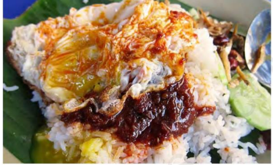
Go off the beaten path, they say, and you'll find treasures

Home > Where To Eat > Malay > Nasi Lemak Ceri