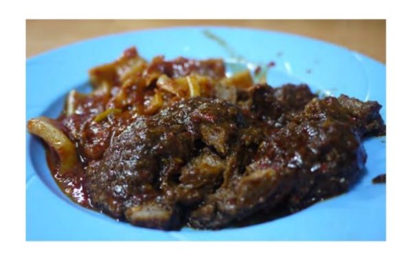
Figure 4: Up-close shot of side dishes or lauk taken from Review 1 (Nasi Lemak Marvellous)