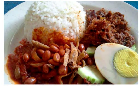
The quintessential Malaysian breakfast covers a large area,

Home - Where To Eat - Nasi Lemak Royale Kedah