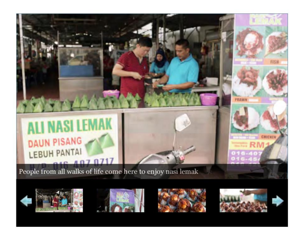
Figure 7: The most extended Story Board collection from Review 12 (Nasi Lemak Ali) with 13 images

experience gives the readers a sense of flipping through an actual book when browsing through the image collection.