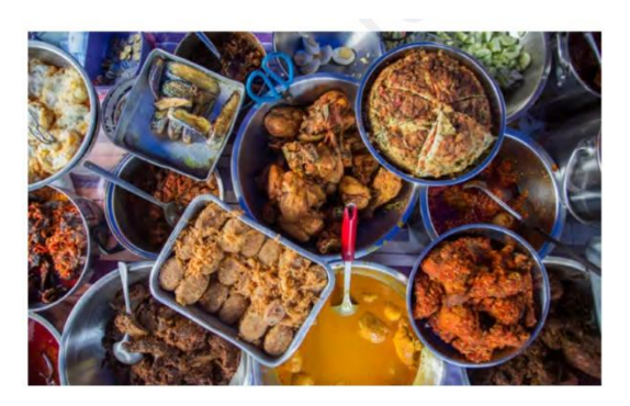
Figure 5: An array of side dishes (lauk) selection taken from Review 10 (Nasi Lemak Famous) and Review 14 (Nasi Lemak Alor Corner) (left to right)

When Supplementary Visuals comprise people and places, they entail shots of vendors/owners, customers, and the outlet itself (Figure 6). Images featuring customers depict customer lines, whilst vendors/ owners are head-shot portrayals where the vendors are photographed smiling amicably at the readers. The latter visuals create a friendly atmosphere and radiate warmth, appealing to readers at a more personal level and demanding interaction with the viewers (Ledin and Machin 84).