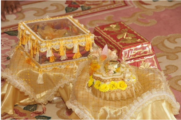
Photo 2 : Tepak Sirih covered with gold embroidered velvet are used during the ceremony.

Representatives from the male's side would bring a few items as gifts to accompany the tepak sirih and a ring for the engagement ceremony. Exchanging gifts from two sides (male and female) was conducted after the representatives of both party were satisfied with the discussion. The discussion during the engagement ceremony would be related to the bride's dowry, date and time of wedding ceremony and also the mahar (in Islam this is a compulsory gift from the groom to the bride). Implicitly engagement customs symbolize that the man and the woman would become husband and wife within the period of time that was agreed to in a family organized ceremony.