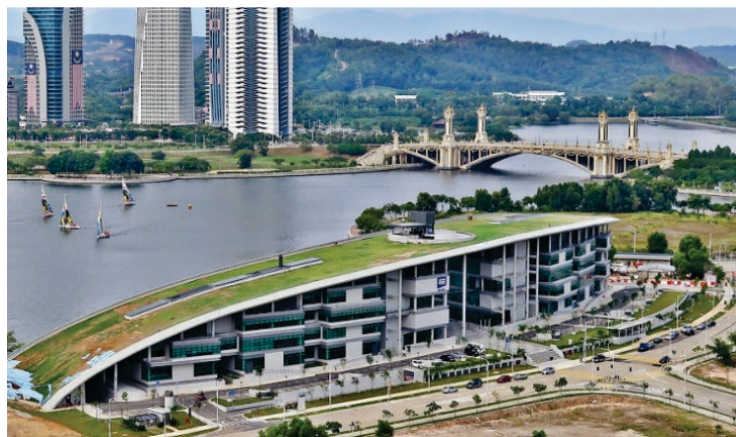
Figure 2. Extensive Green Roof

In Malaysia, the basic category of green roof installed is the intensive type of green roof rather than the extensive green roof (Rahman et al. , 2013). This is because of the plant selection for the extensive green roof is limited rather than the intensive green roof that lowers the aesthetic value of the green roof. The green roof also contributes numerous advantages for instance, decreasing heat flux, enhancing energy efficiency, optimizing the management of stormwater system, improving carbon sequestration and pollutant trap, along with enhancing building and urban cooling.