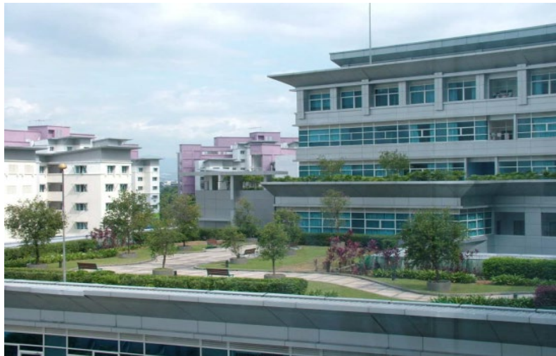
Figure 1. Intensive Green Roof