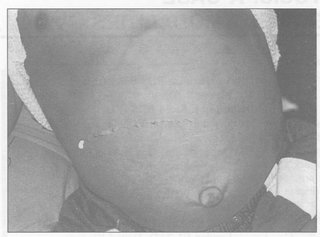
Figure 2: Shows a picture of the abdomen demonstrating hepatosplenomegaly

patient suffered recurrent bouts of fever and cervical lymphadenopathy. He was initially admitted to the Kuching General Hospital and treated with antibiotics but the bouts of fever persisted. He then went on to develop hepatosplenomegaly. At this point he was transferred to Kuala Lumpur for further assessment.